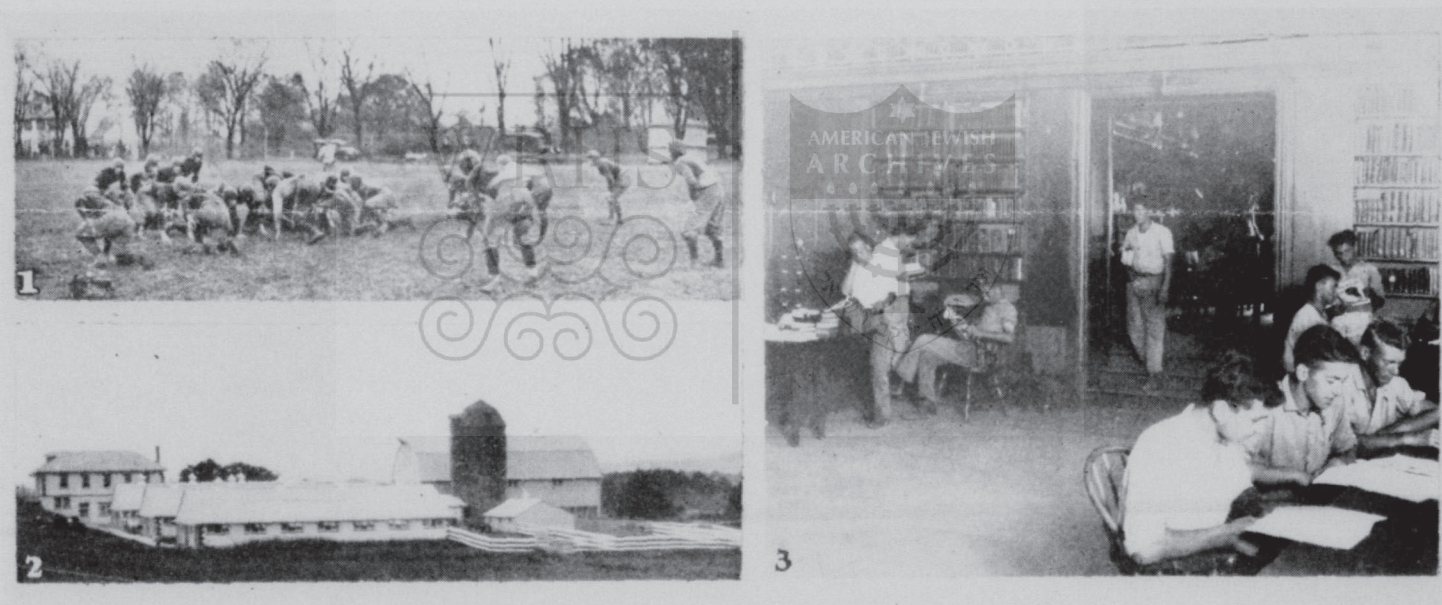
1—Football practice at National Farm School.