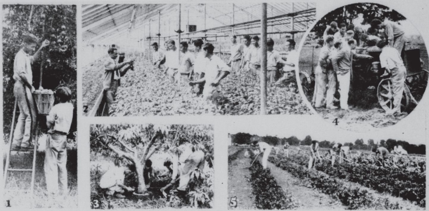
1—Apple Picking at National Farm School. 4—Learning how to repair a tractor.