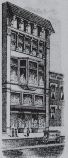
1315 CHAPLINE STREET.