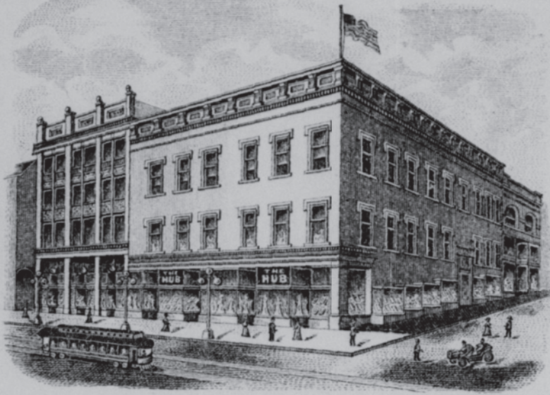
1324, 1326, 1328, 1330 MARKET STREET CORNER FOURTEENTH.