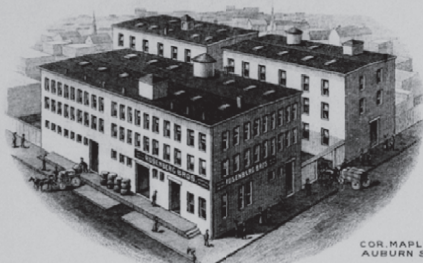
COR. MAPLE & AUBURN STS.