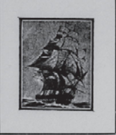
THE U. S. FRIGATE CONSTITUTION