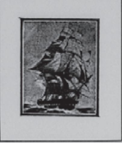
THE U. S. PRIGATE CONSTITUTION