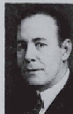
HERBERT R. O'CONOR GOVERNOR