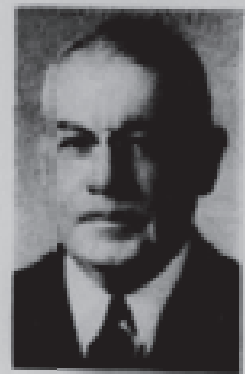
WILLIAM E. EDGE GOVERNOR