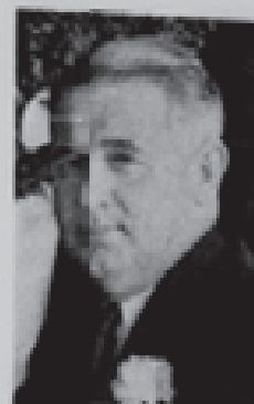
LESTER C. HUNT GOVERNOR