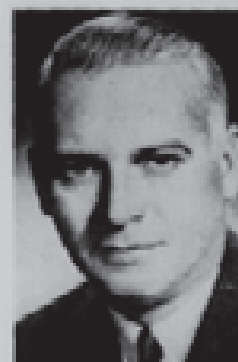
DWIGHT H. GREEN GOVERNOR