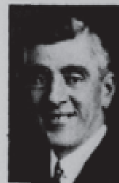
LEVERETT SALTONSTALL GOVERNOR