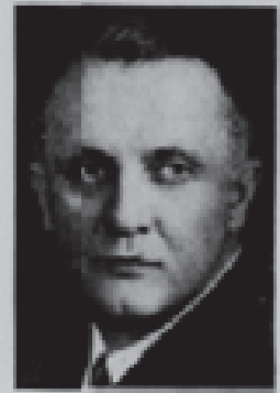
COLGATE W. DARDEN, JR. GOVERNOR