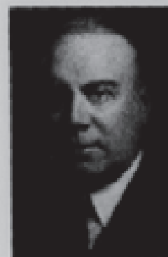
RAYMOND E. BALDWIN GOVERNOR