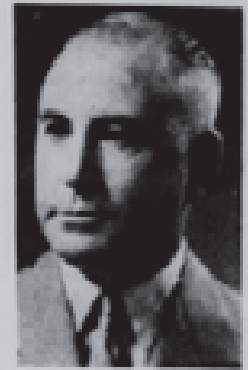
MATTHEW M. NEELY GOVERNOR