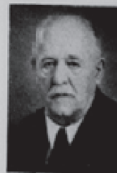
WALTER S. GOODLAND ACTING GOVERNOR