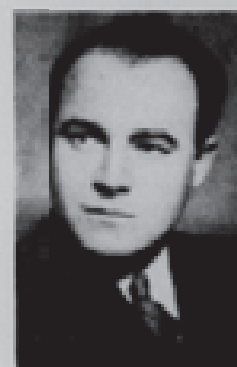
J. HOWARD MCGRATH GOVERNOR