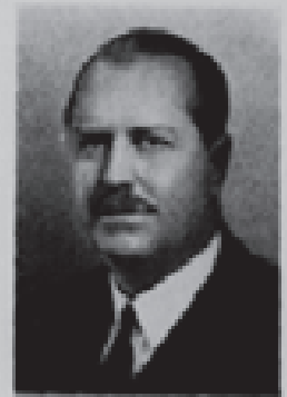
SUMNER SEWALL GOVERNOR