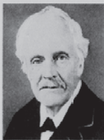
ARTHUR JAMES BALFOUR