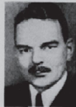
THOMAS E. DEWEY GOVERNOR