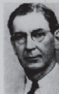
SIDNEY P. OSBORN GOVERNOR

Executive Office State House Phoenix, Arizona