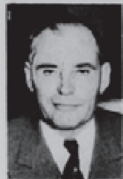
COKE STEVENSON GOVERNOR