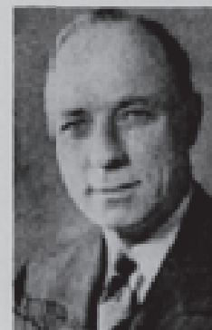
BOURKE B. HICKENLOOPER GOVERNOR