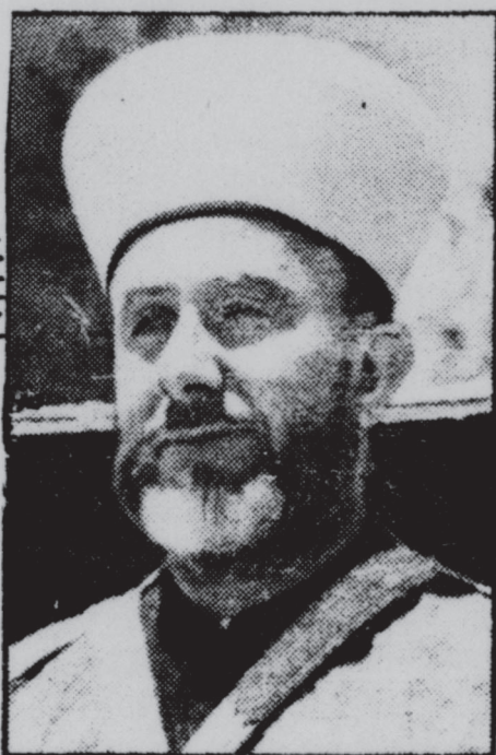
Hadji Amin el Hussein Spearheaded slaughter of Jews.