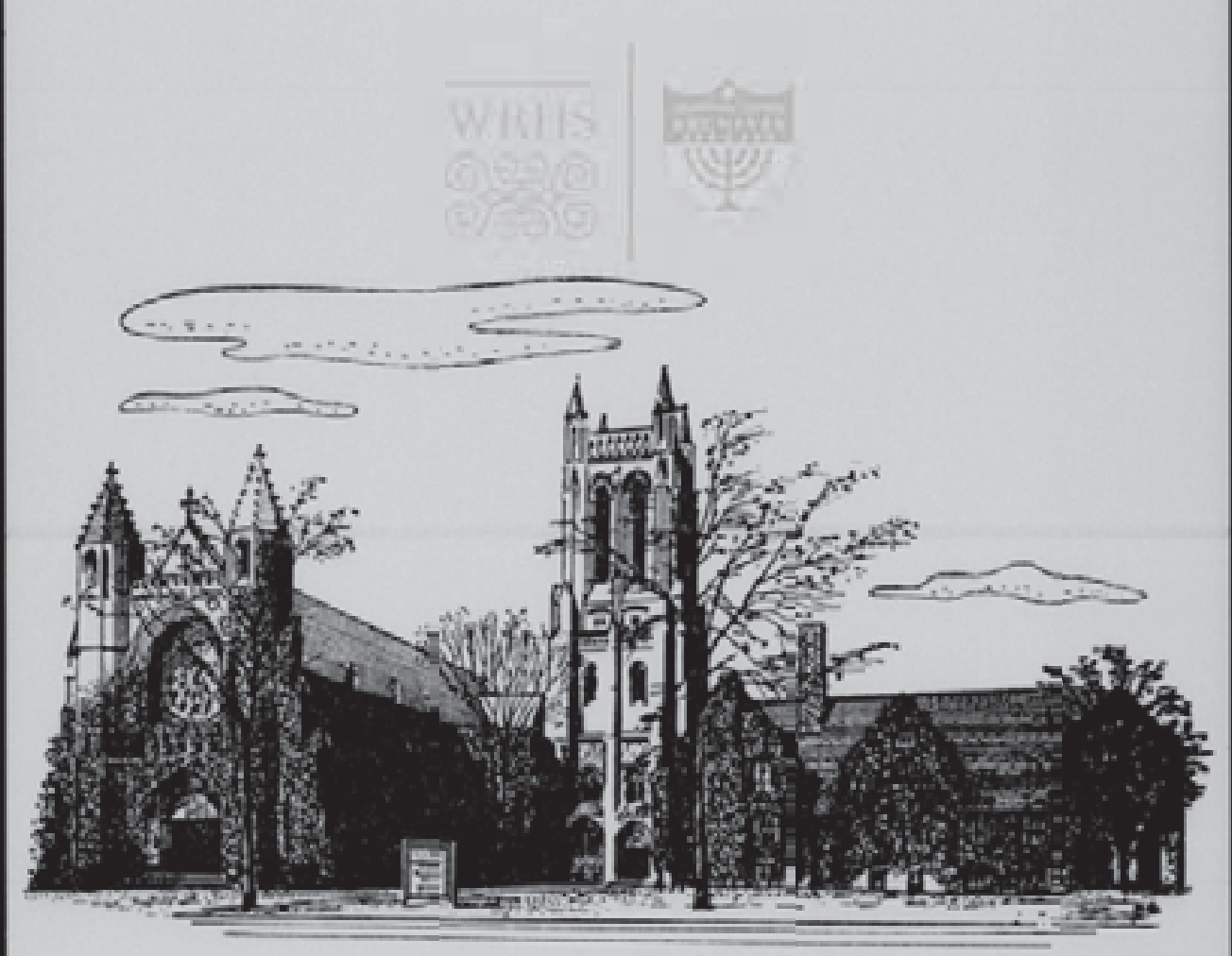
The Church of the Covenant, Cleveland, Ohio