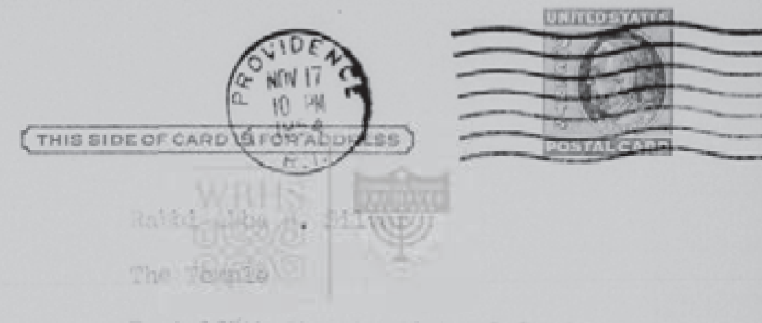
East 105th Street and Ansel Road Cleveland, Chic