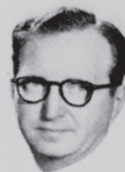
MR. LAWRENCE SPIVAK

Producer and permanent Panel Member of N. B. C's "Meet The Press"