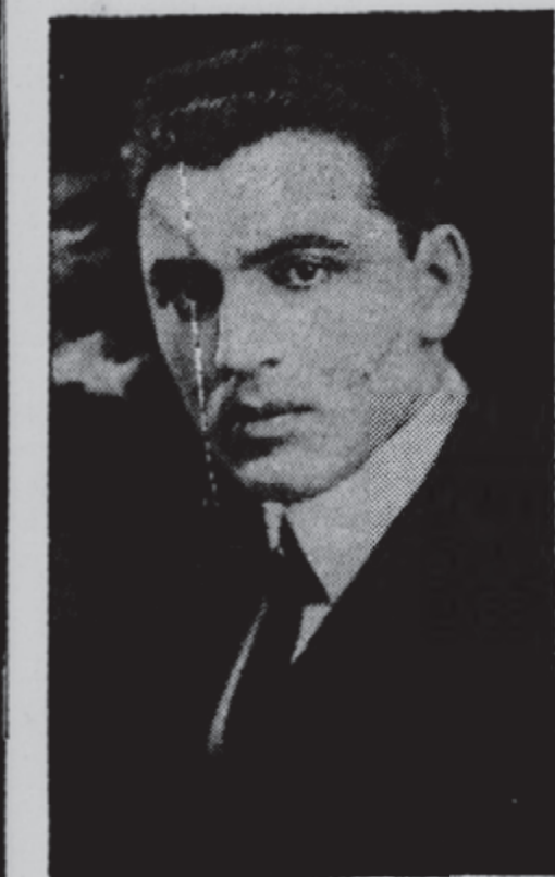
RABBI ABBA HILLEL SILVER

every other form of organized religion—has been content to speak of it as an ultimate desideratum, a condition highly to be desired but so far removed as to be beyond the pale of practical and immediate concern. But necessity and the events of the last two or three generations have thrust this abstraction into the realm of reale politique and have turned it into the most pressing and perplexing problem of the day.