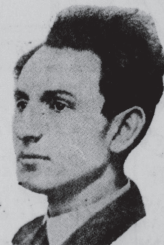
UPTON CLOSE The outstanding authority on Asia in America. Forceful lecturer on topics of vital importance to America.