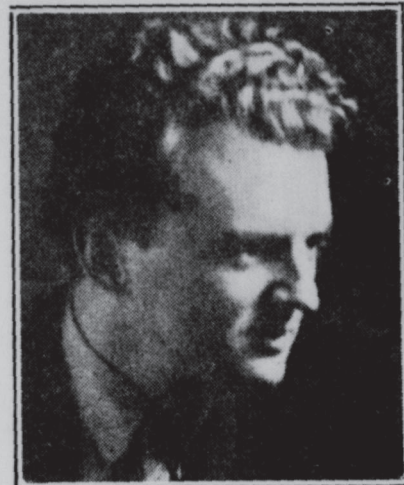
JOHN LANGDON DAVIES Distinguished British writer and man of affairs. Author of "A Short History of Women," and "The New Age of Faith."