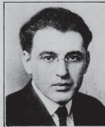
ABBA HILLEL SILVER America's Foremost Rabbi and Orator