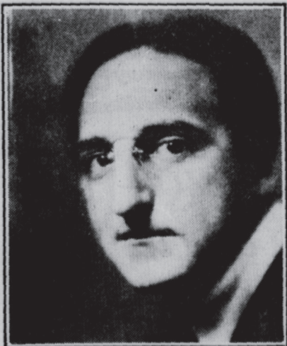
LOUIS UNTERMAYER Poet, Critic and Anthologist, Author of "Challenge," "These Times" "Yesterday and Today," and many others.