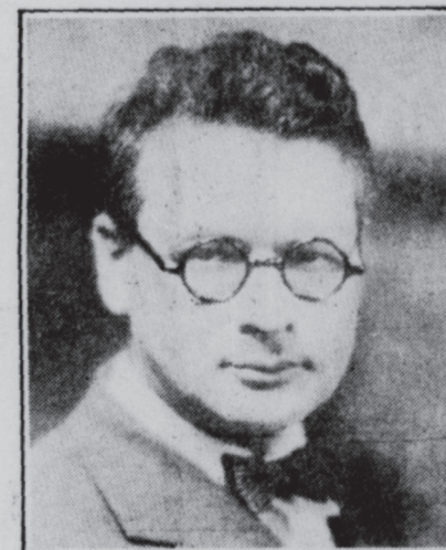
HORACE M. KALLEN Author of "The International Mind" "Why Religion," and "Culture and Democracy in the United States."