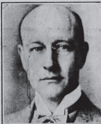
ROY CHAIPMAN ANDREWS Head of the Third Asiatic Expedition Hunting the Bones of Primitive man—Remarkable Motion Pictures.