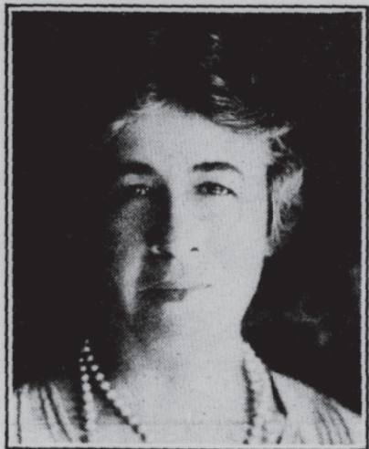
RUTH BRYAN OWEN Daughter of the Late Commoner William Jennings Bryan, Congressional candidate in Florida.