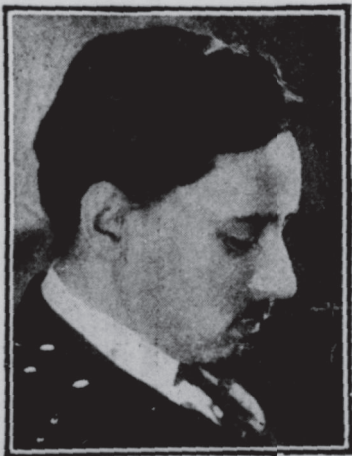
WILL DURANT Author of "The Story of Philosophy," "Transition."