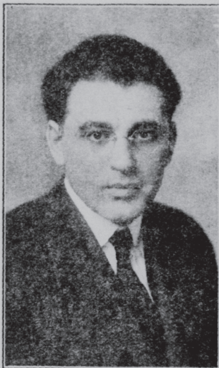
Rabbi Abba Hillel Silver

The concluding Friday evening service will be held on March 27, at which time Rabbi Abba Hillel Silver, one of the great Jewish leaders of the country, will preach the sermon.