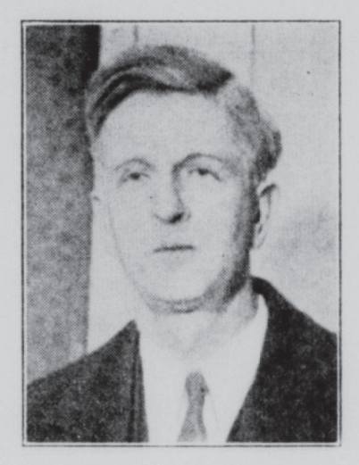
JAMES G. McDONALD A world figure and humanitarian whose interests transcend all barriers of race, creed and national boundaries.