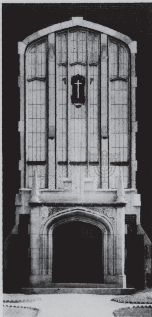
JOHN A. PATTEN MEMORIAL CHAPEL