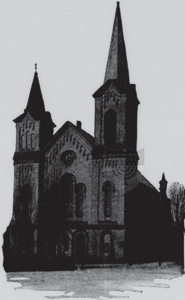
Old Church Building, Dedicated 1874 Used forty-eight years