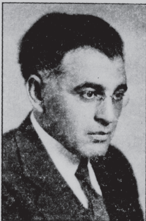
Dr. Abba Hillel Silver

In France during the World War, Dr. Silver received a decoration from the French government. He has served as university preacher at Harvard, Cornell, Syracuse, Purdue, and the University of Chicago.