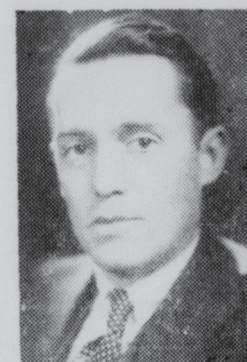
Marquis W. Childs