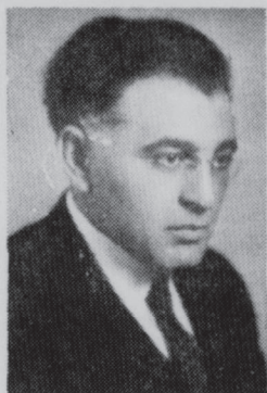
Dr. Abba Hillel Silver