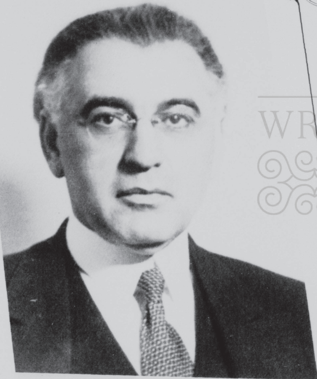
Dr. Abba Hillel Silver