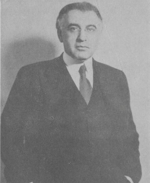
Dr. Abba Hillel Silver, America's greatest orator, is one of the leaders responsible for the establishment of the State of Israel.