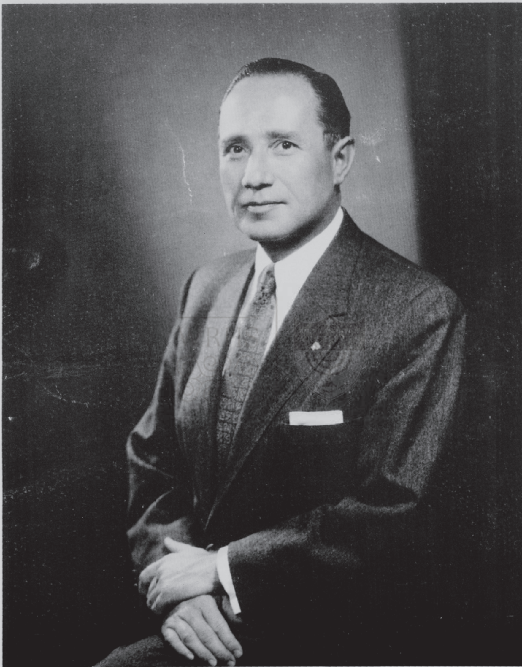
PHILIP M. KLUTZNICK President of B'nai B'rith