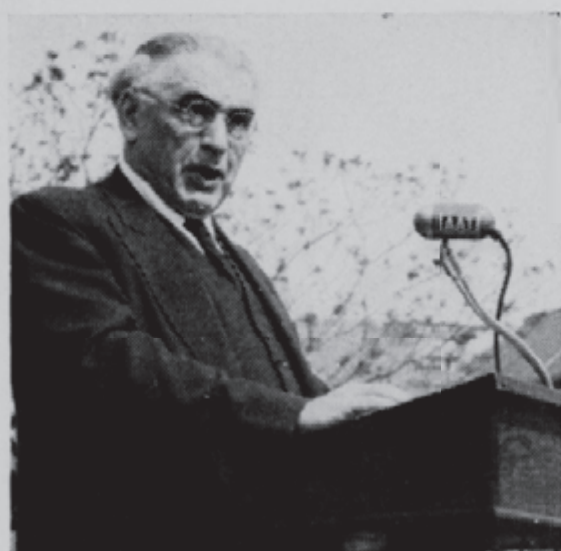
Rabbi Abba Hillel Silver

IT is altogether fitting that the B'nai B'rith, the foremost humanitarian service agency of American Jewry, should erect an impressive building here in Washington at the crossroads of American life which will not only house its national activities, but which will tell in pride and gratitude, to the many who will come to this city for the future from all parts of the nation—may, from all parts of the world—the heroic and magnificent story of the contribution of American Jews to the life, progress and defense of America. It is a story worthy to be told not alone to ourselves, but to our fellow citizens.