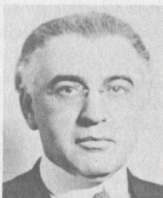
Rabbi Abba Hillel Silver February 5

of the Reform Congregations of Baltimore