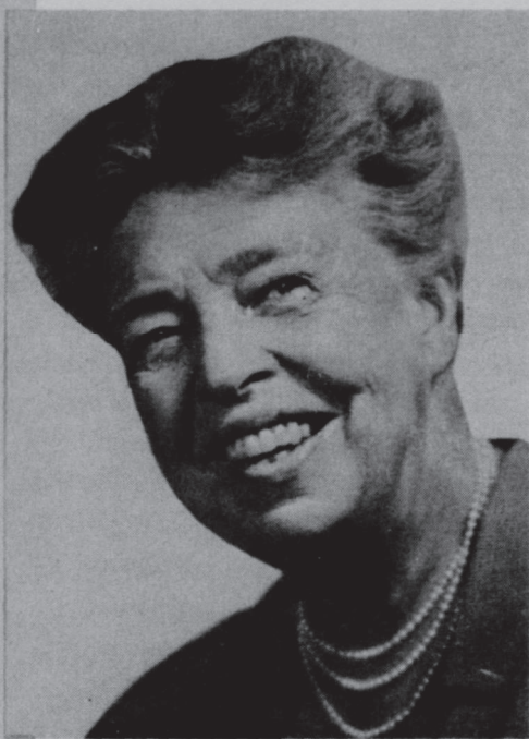
Mrs. Franklin D. Roosevelt

Temple Emanuel is proud of the privilege of presenting the "FIRST LADY OF THE WORLD" to the community of Worcester. Truly, Mrs. Roosevelt is one of the great Americans in our history. A respected diplomat, author and humanist, she has served in many critical positions representing the United States Government, the United Nations as Chairman of the Commission on Human Rights and the American people to other nations throughout the world. A poll by a leading national magazine revealed her to be, to the American women, "the most popular living American of either sex." According to the American Institute of Public Opinion she has been selected the "most admired woman living today in any part of the world."