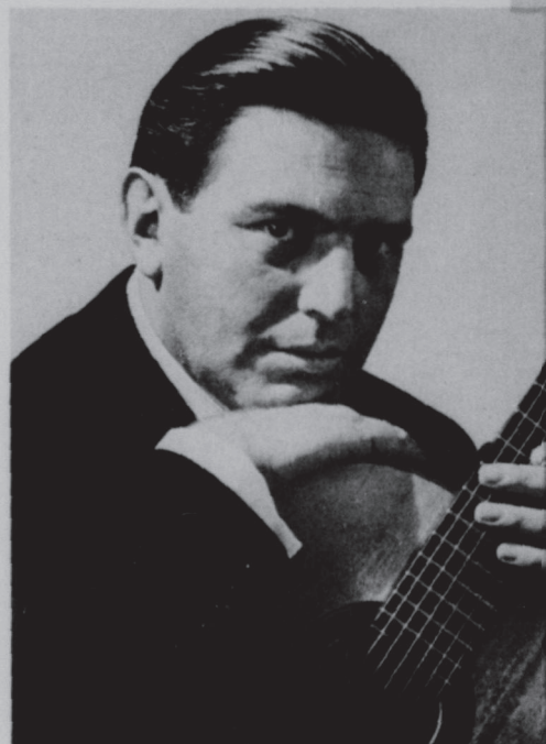
Mr. Theodore Bikel

Co-star for two years with Mary Martin in "The Sound of Music," and acclaimed artist of stage, screen, television, and radio, Theodore Bikel is also one of folk music's most treasured artists. Speaking seven languages fluently, Bikel's repertoire includes over 500 songs from twenty lands in their native tongues. His tremendous appeal as folk singer is demonstrated by the turnouts to his frequent one-man concerts in New York's Town Hall and other concert halls throughout the country, together with his eleven best-selling Elektra albums. As the New York Herald Tribune reported recently: "People outside the hall were offering any price for any seat inside; the hall itself overflowed onto the platform!"