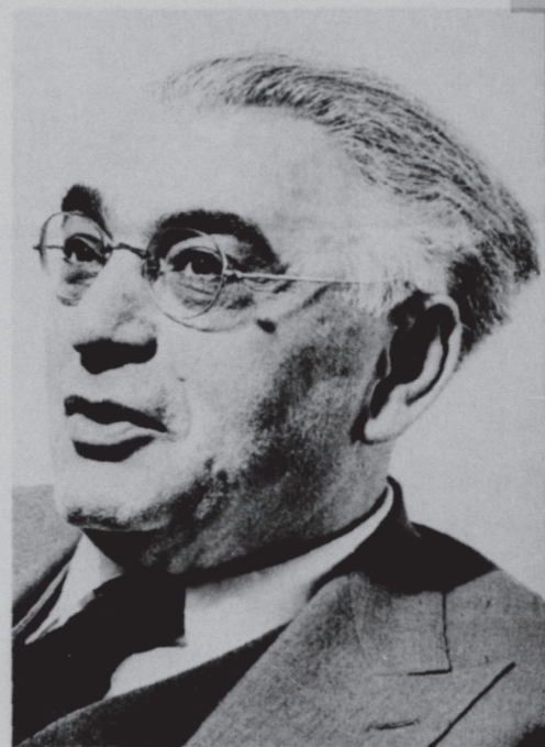
Dr. Abba Hillel Silver

Dr. Silver has for forty-four years been spiritual leader of The Temple in Cleveland, the largest liberal congregation in the United States. Dr. Silver was recently honored by Life Magazine as one of the twelve leading preachers in the United States. A world renowned author, his book "Where Judaism Differed" has become a religious best seller. The foremost spokesman of Zionism in this country, he was one of few primarily responsible for the establishment of the State of Israel. He is considered the ablest preacher in the American Rabbinate.