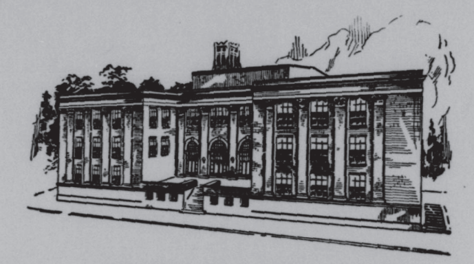
BRODHEAD AND PACKER AVENUES BETHLEHEM, PENNA.