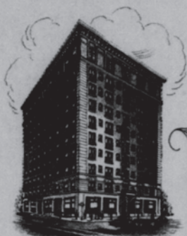
THE CHAMBERLAIN DES MOINES, IOWA