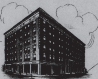
THE OTTUMWA OTTUMWA, IOWA