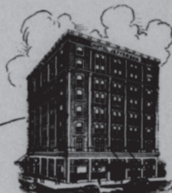
THE JEFFERSON IOWA CITY, IOWA