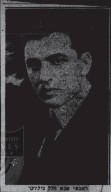
רבי א. ה. סילבר

Rabbi A. H. Silver will be the speaker at the February meeting of the Parent-Teacher association of Fairfax school, Lee and Fairfax roads, Cleveland Heights, Monday evening, in the school auditorium, at 8 o'clock. Rabbi Silver will speak on "A Saint of Democracy—Abraham Lincoln." There will be music and refreshments following Rabbi Silver's talk. Fathers of school children are especially urged to attend this meeting.