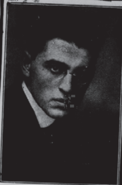
DR. ABBA HILLEL SILVER