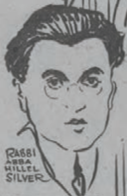
RABBI ABBA HILLEL SILVER