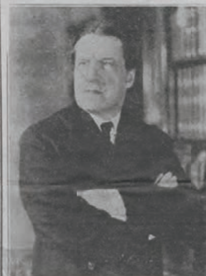
Rabbi Stephen S. Wise

ance has led many to accuse Dr. Wise of being deliberately theatrical and showy. Dr. Wise himself would probably not deny the accusation. It has been said that in him the stage has lost a great actor. But the stage's loss has been the pulpit's gain, for the latter can now boast that it is served by one of the greatest of tragedians. Dr. Wise's superb histrionics are to