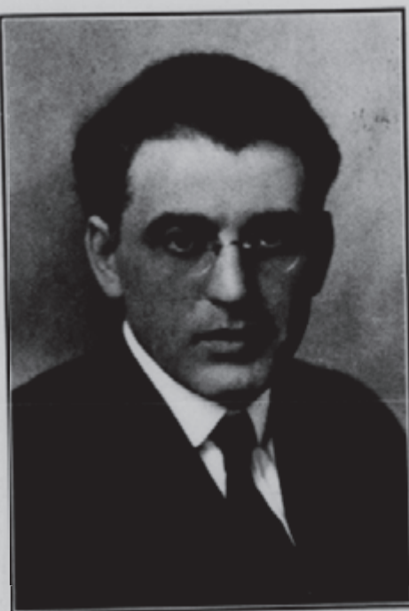
« Rabbi A. H. Silver »

Please send in your reservation promptly.