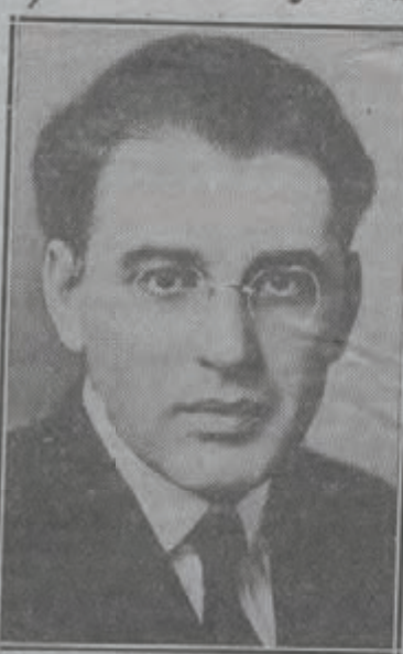
RABBI ABBA HILLEL SILVER.