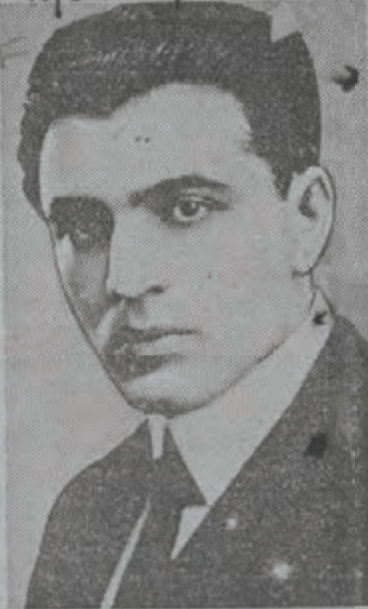
RABBI ABBA HILLEL SILVER

Prosign Tribune The Allied Jewish Campaign for