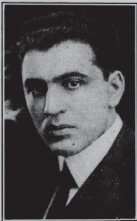
Abba Hillel Silver

Between the dining room of the Governor Clinton Hotel and the shade of a fig tree in the Jordan Valley, there is, perhaps, a contrast. Yet as I talked with Rabbi Silver over our coffee, I could not but recall a scene, nineteen hundred years ago, when a similar man,