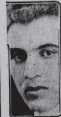
RABBI A. H. SILVER

THE sixth anniversary of the Bureau of Jewish Education in Cleveland will be celebrated on the night of March 3 with a dinner in Hotel Cleveland. Invitations have been sent to 5,000 persons who contribute annually toward the work.