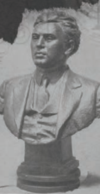
Bust of Rabbi Silver, sculptured by Max Kalish

RABBI ABBA HILLEL SILVER, for the past 13 years spiritual leader of The Temple, Cleveland, delivered the principal address at the 80th anniversary celebration of the congregation last month. Included among the other speakers were Felix M. Warburg and Newton D. Baker.