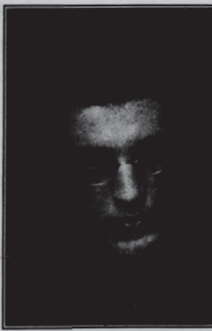
Dr. Abba Hillel Silver

an orator. He is a member of the Actions Committee of the World's Zionist Organization and of the Jewish Agency; president of the Bureau of Jewish Education in Cleveland, member of the board of governors of the Hebrew Union College and of the Hillel Foundation; member of the National Committee opposed to Military Training and of the National Child Labor Committee. Some time ago he received the Academic Palms from the French government. He is also the author of several books.