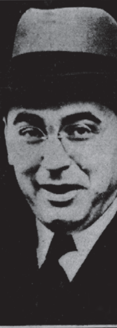
Rabbi Abba Hillel Silver, Cleveland, who spoke before the Ad-Sell league Monday night on "Is Progress a Myth?" He later addressed the Jewish Community Center forum.