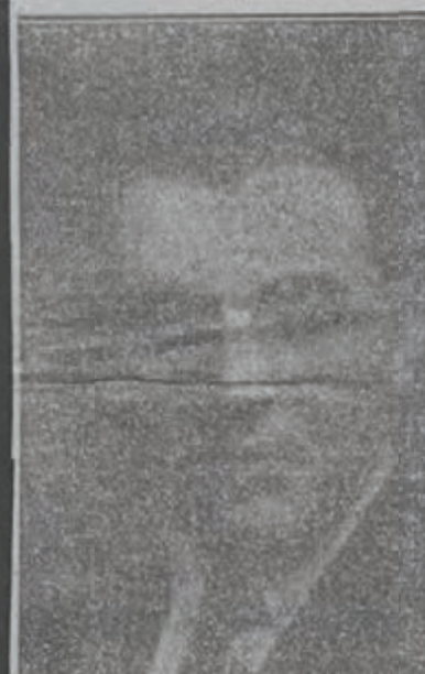
Dr. Abba Hillel Silver.

To one of the outstanding speakers on last year's program—Dr. Abba Hillel Silver, of Cleveland, O.—goes the distinction of opening the 1930-31 Ethel Zion forum lectures tomorrow evening in the Joseph Johns Junior High School auditorium, Market st., at 8:30 o'clock. Along with Lewis Browne, author, Dr. Silver was re-engaged for a prominent place on this year's program. His lecture becomes the first of the current series due to illness preventing the appearance last month of Dr. Stephen Wise, of New York City. Dr. Wise's appearance at the far end of the season is expected to be the outgrowth of a popular demand from the forum lecture patrons.