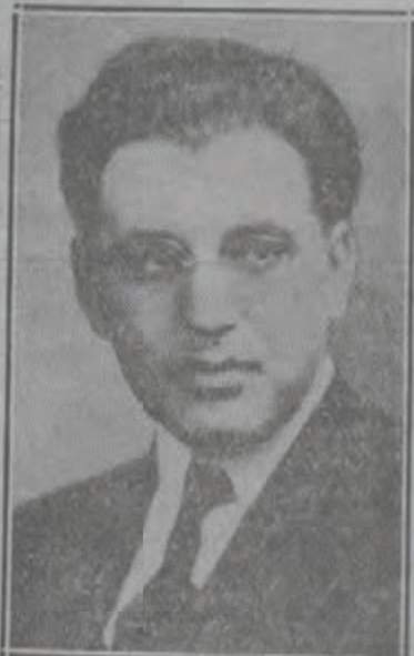
Rabbi Hillel Silver

"Herein social service reaches its profoundest purpose and attains its highest inspiration. The noblest charity is not that which seeks with things to satisfy wants, but that which places at the disposal of the groping and helpless fellow human beings the strength which may be ours, and the experience and the wisdom—one soul reaching out to another—one mind kindling another. We give to our fellowmen, in our finite and imperfect way, the gifts which we ask of God—strength and understanding and guidance."