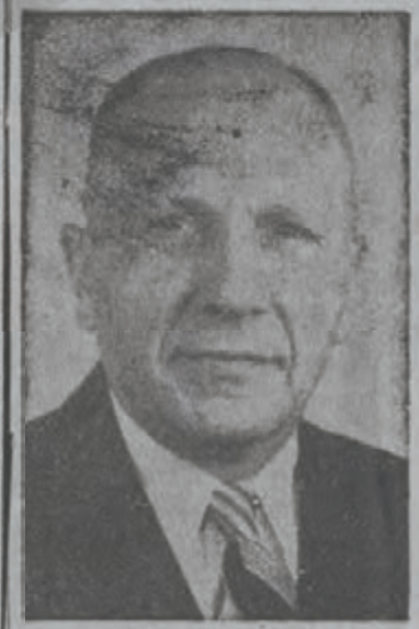
בנימין ב. בראדני פרעזידענט פון ציון ארגאניזאציע

ווי ענטפערט בן-גוריון וועגן וועלט-ציונים