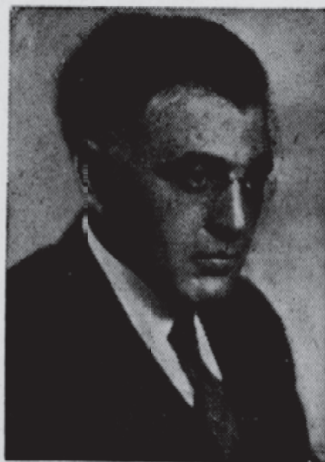
Rabbi Abba Hillel Silver

In his introductory remarks to the third and fourth lectures, Rabbi Silver manifested a tendency to appease the pro-war elements both inside and outside his congregation. He defensively stated that he did not favor appeasing the Soviet Union—an accusation which had been levelled