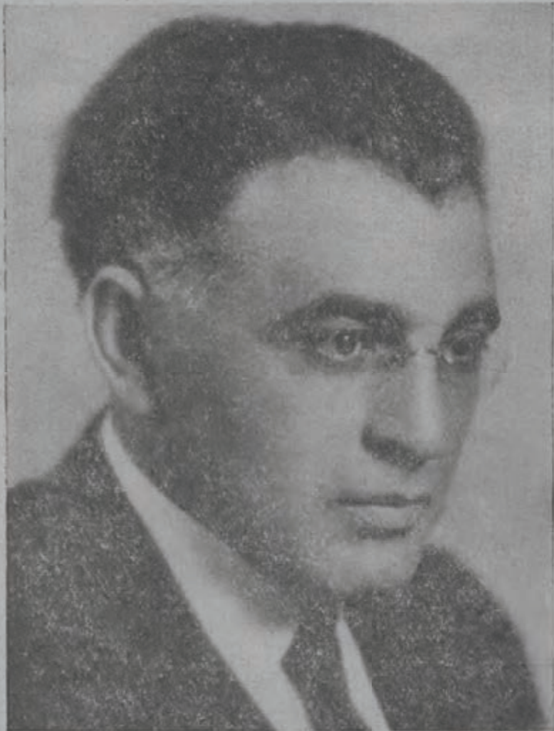
DR. ABBA HILLEL SILVER Of two cities, Indianapolis is one.