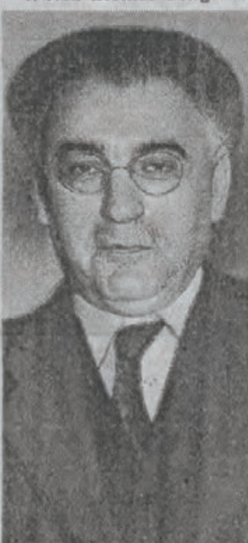
Dr. Abba Hillel Silver

TEL AVIV, Israel, April 26 — Rabbi Abba Hillel Silver of Cleveland, one of the most controversial figures in Zionism, will return to the Zionist political arena at the World Zionist Congress scheduled to open in Jerusalem in August.