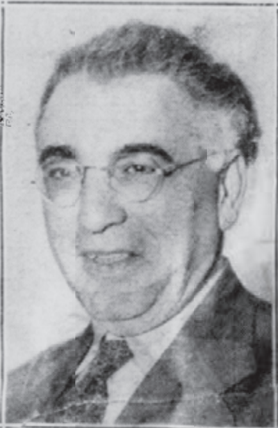
Dr. Abba Hillel Silver Takes Truman to task.

Well, hold your hats, boys. As we observed, the time may be just around the corner when you'll have no trouble cracking a one-grand bill because they'll be as common as a sawbuck today—and probably buy less coffee and cakes.