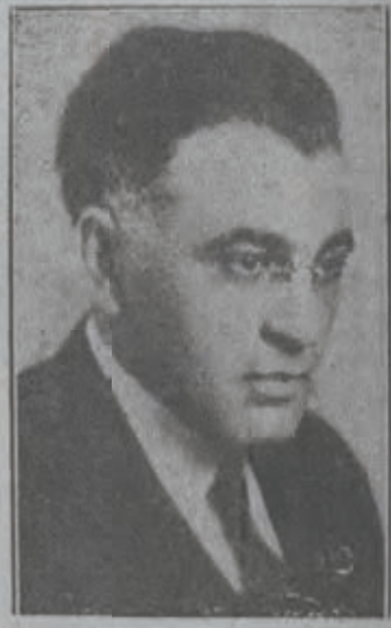
ד"ר אבא הלל סילבער באריסטער ציוניסטער פירער

די פייערליכע דערפערונג פון דעם ציון ארגאניזאציע, ביי וועלכער נאכ וועט אנטישיידעט ווערן, ווי פיל פון די דעלעגאטן געווענען, דער גורל פון דער ציוניסטישער באוועגונג איז בער דער וועלט איז פארגעקומען אי