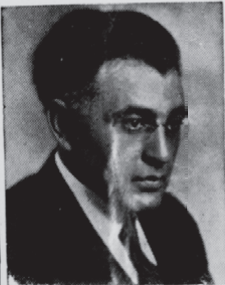
RABBI ABBA HILLEL SILVER

Now that America has reached the stage of virtual war with Russia the Administration does not plan to ask Congress for war but seeks to drag this country in deeper through such measures as the national emergency, Silver warned.